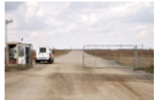
Burnstone Mine entrance