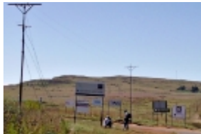
Brakfontein Rd turn-off