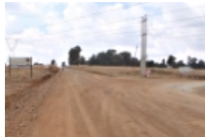
Burnstone Mine turn-off