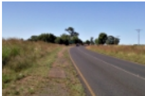
Sign to Balfour just after trees